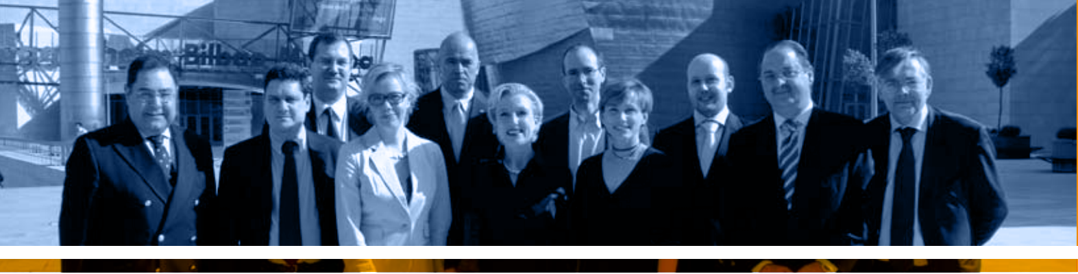
EB Meeting Bilbao, April 2008. From left to right: